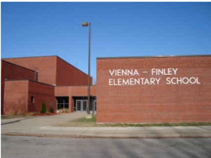
Vienna-Finley Elementary School