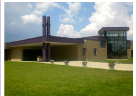
Scottsburg High School