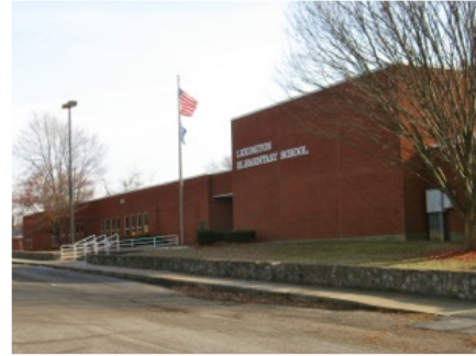
Lexington Elementary School

7980 E. Walnut Street Lexington, IN 47138 (812) 752-8924 Chuck Rose, Principal