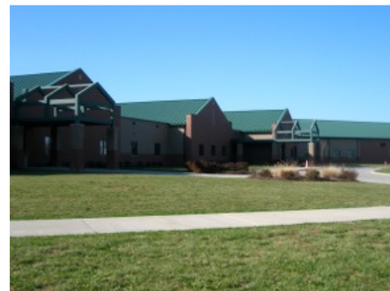
Scottsburg Middle School